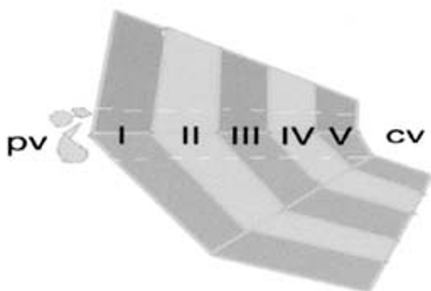
Figure 1 Zonal division of the liver lobule. To make a zonal morphometric analysis, we divided the liver lobule histologically into 5 zonal areas of equal widths (I, II, III, IV, and V) from the portal vein (pv) to the central vein (cv).