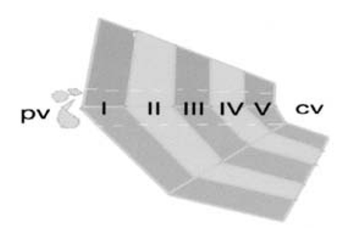
Figure I Zonal division of the liver lobule. To make a zonal morphometric analysis, we divided the liver lobule histologically into 5 zonal areas of equal widths (I, II, III, IV, and V) from the portal vein (pv) to the central vein (cv).